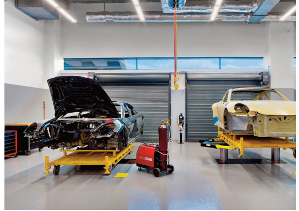
Stonclad GR floor in the training center.

Stonhard provided PCNA with a unique installation of the Crush flooring system, complete with a custom aggregate troweled at a thickness of 3/16". The floor surface is a very large portion of the PCNA facility, which makes this exclusive look an integral part of the bold, state-of-the-art design of the space.