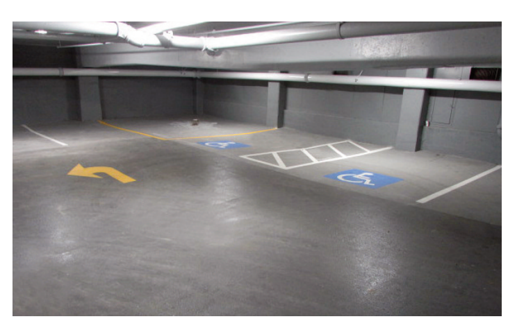
After Stondeck XD2 installation