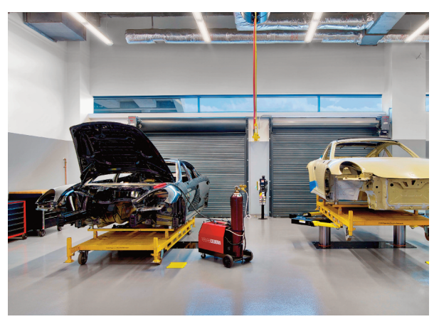
Stonclad GR floor in the training center.

Stonhard provided PCNA with a unique installation of the Crush flooring system, complete with a custom aggregate troweled at a thickness of 3/16". The floor surface is a very large portion of the PCNA facility, which makes this exclusive look an integral part of the bold, state-of-the-art design of the space.